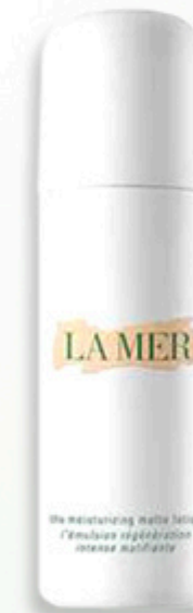
Body moisturizer LAMER - U$ 443,00