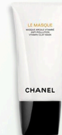
Anti-Pollution Clay Mask CHANEL - U$ 77,00