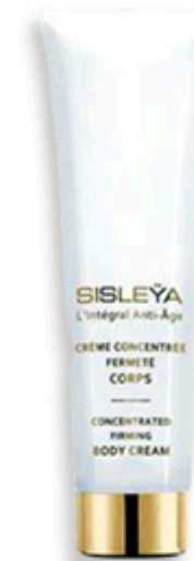
Body cream Anti-Âge SISLEY - U$ 452,00